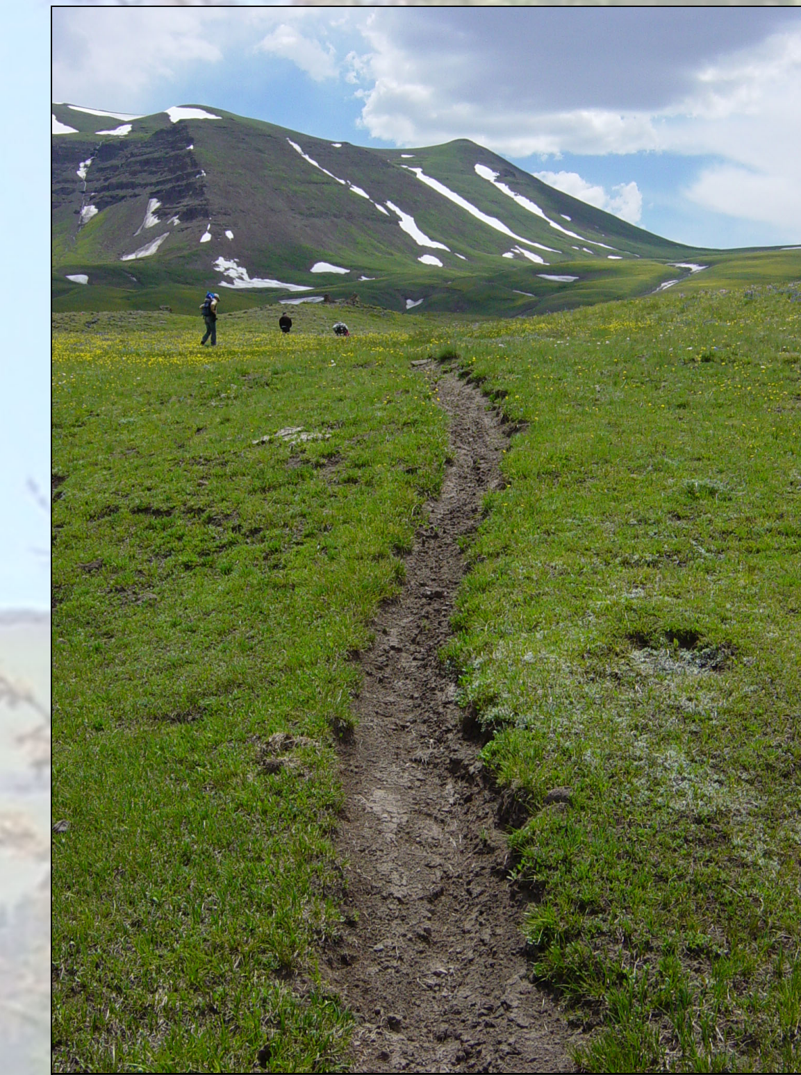
Figure 4: Well worn game trail, located near FF 001

After walking several transects, it has been seen that game trails generally occur on more difficult terrain such as steep hillsides, along the creek banks, or at the edge of the cliffs that were located in one section of the survey. There were also many game trails in the forests, but due to the limitations of the GPS system, waypoints in the forests aren't recorded accurately. The sites in our survey area were found on level ground, and often had commanding views of the surrounding land. There are fewer game trails on the flat, open land because there is a much wider area that provides easy travel and the animals can spread out. On steeper areas, all of the animals in the herd will follow the path of least resistance, every time. This increases the impact they have on the land. This is also true in the forests where trees limit the animals to a few easily traveled paths. It is also possible that on flat ground all the animals of the herd can locate one another easily, but difficult areas of terrain can hide predators as well as members of the herd, so it safer to group together.