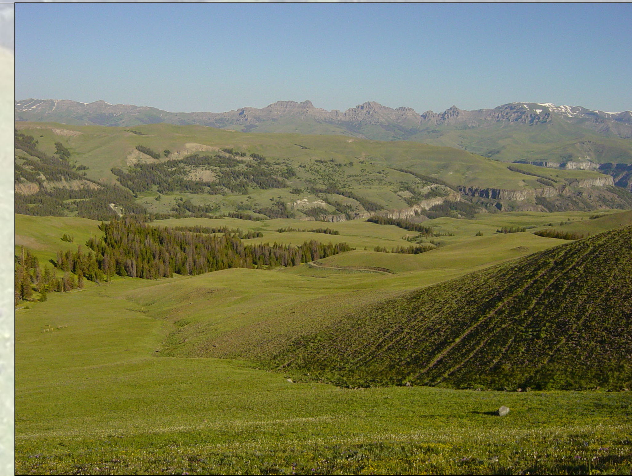
Figure 3: Multiple game trails on hillside, transect 3

Prehistoric use of the mountains included big game hunting. A number of factors such as predator density, forest cover, snow depth, etc influence game movement patterns and hence human hunting strategies. While these have varied considerably, and cannot be taken as being of direct relevance to understanding prehistoric game movements, another factor-local topography provides a nearly constant influence of game movements. This project explores contemporary game trails' proximity to archaeological sites in order to better understand game movement patterns in relation to local topography. This was accomplished by sampling the landscape around sites using a series of east to west transects. These transects were positioned to encounter areas of high topographical diversity defined by high ridges to the west and a creek at the east end of an area previously surveyed for archaeological sites. Each game trail intersected by a transect was waypointed with GPS, as well as recording the orientation of travel. After walking several of these transects, it was seen that game trails are most frequently found on difficult terrain such as steep hillsides or along waterways, while the flat open areas where archaeological sites are found generally do not contain game trails.