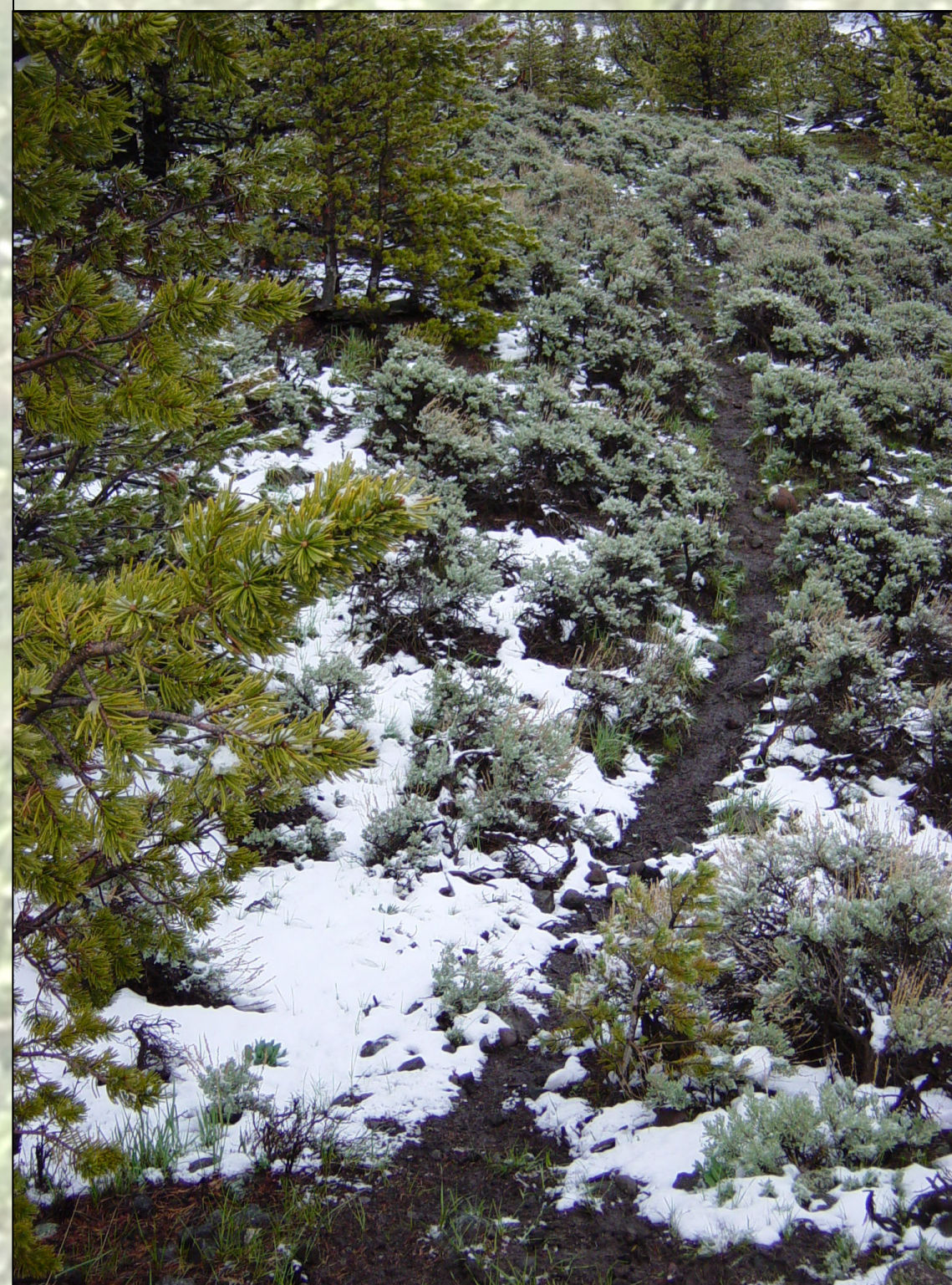
Figure 2: Game trail seen through snow near site JC 013

To find a correlation between game trails and site locations, this experiment was designed to run East to West transects starting from a high ridge and surveying to a creek at the west end of the area. Each transect was 500 meters apart, and an average of 30 game trails were marked on each of the six transects walked. The game trails crossed by each transect were waypointed using a Garmin Rino110 and the orientation was recorded with a Brunton.