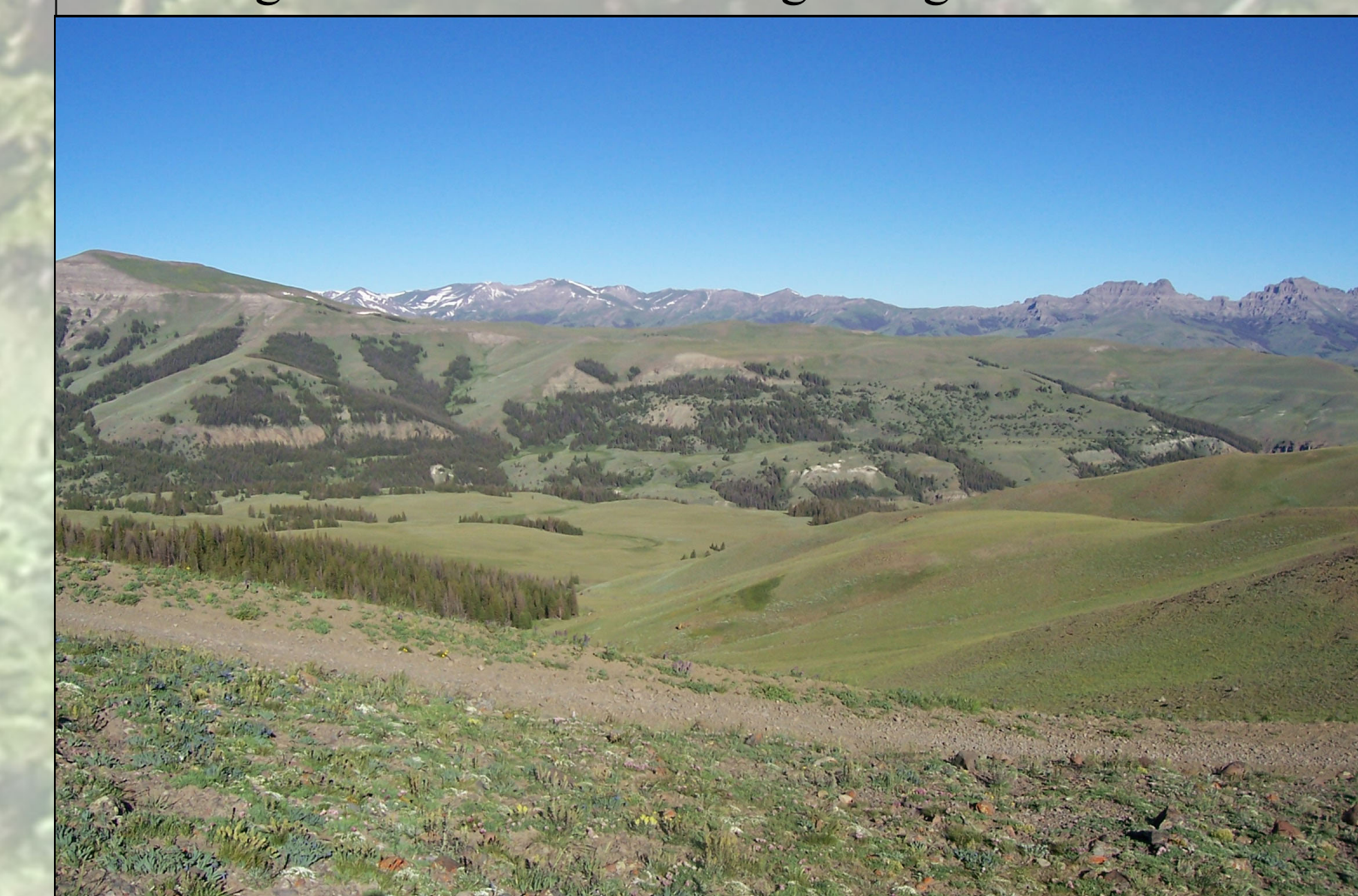
Figure 6: Game trail at beginning of transect 6