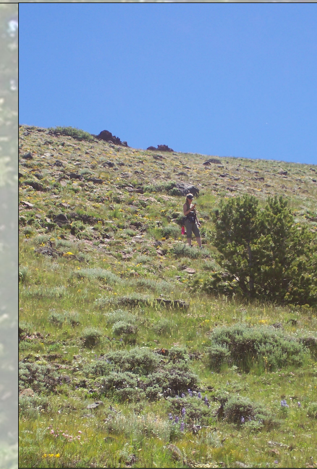
Figure 5: Researcher recording a game trail during transect 3