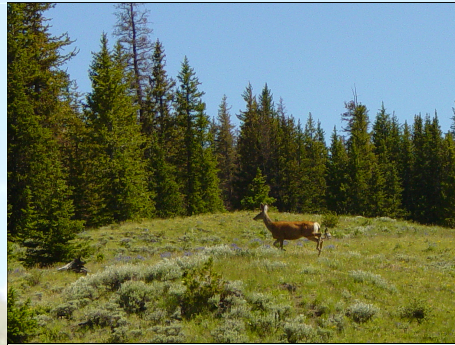
Figure 1: Deer on trail marked during transect 2

both white tailed and mule deer ( Odocoileus virginianus , Odocoileus hemionus ), elk ( Cervus elaphus ), moose